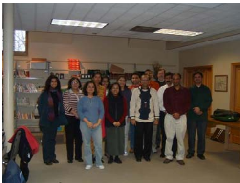
Photo: The 2005 IAM Board